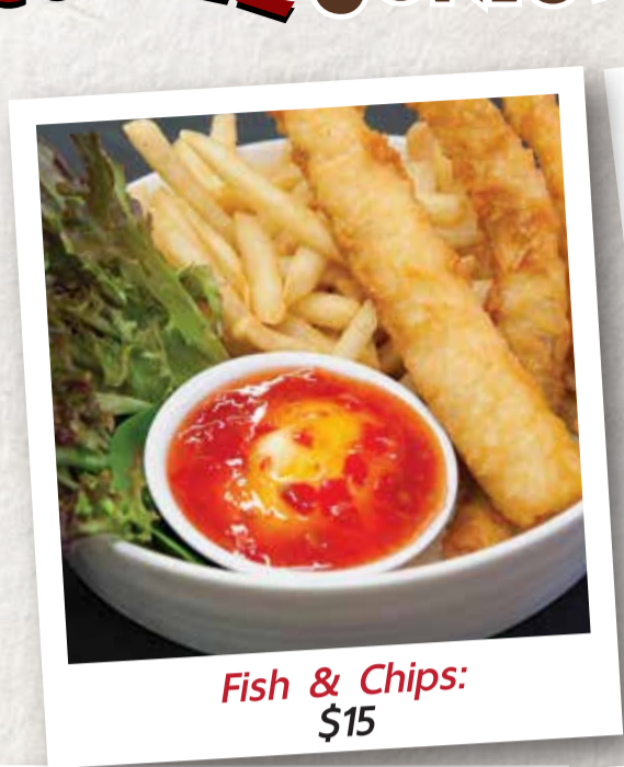
Fish & Chips: $15