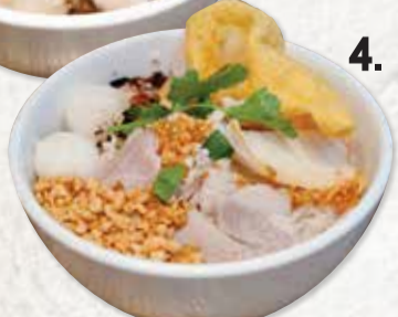
4. Tom Yum Noodle Soup/Dry (S)8.9 (L)13.9 ก๋วยเตี๋ยวต้มยำ น้ำ/แห้ง thin rice noodle spicy soup with minced pork