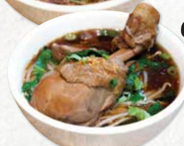
6. Stewed Chicken Noodle Soup (S)9.9 (L)14.9 ก๋วยเตี๋ยวหนังไก่ตุ๋น thin rice noodle soup with stewed chicken