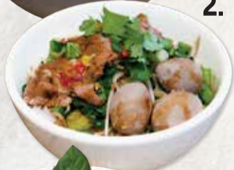
2. Dry Noodle (S)8.9 (L)12.9 ก๋วยเตี๋ยวแห้งลูกชิ้น thin rice noodle or flat rice noodle with sweet soy sauce, garlic, bean sprout, chicken or beef or pork ball