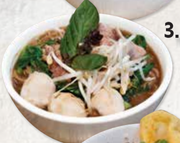
3. Boat Noodle Soup (S)8.9 (L)12.9 ก๋วยเตี๋ยวเรือ thin rice noodle soup with blended herbal soup