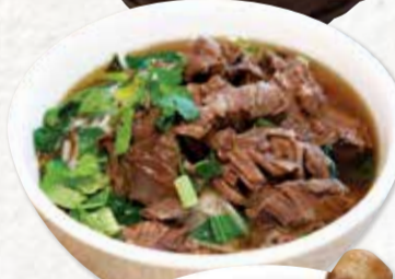
5. Tender Beef Noodle Soup (S)9.9 (L)14.9 ก๋วยเตี๋ยวเนื้อตุ๋น thin rice noodle soup with tender beef