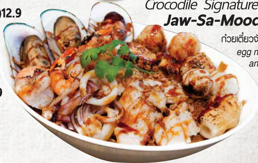
Crocodile Signature (Jumbo) Jaw-Sa-Mood Noodle $24.9 ก๋วยเตี๋ยวจ้าวสมุทร egg noodle with grilled seafood and crocodile junior special sauce