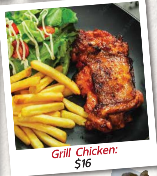
Grill Chicken: $16