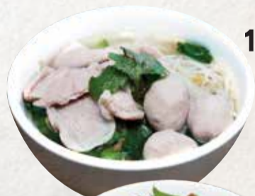
1. Clear Noodle Soup (S)8.9 (L)12.9 ก๋วยเตี๋ยวน้ำใสลูกชิ้น thin rice noodle with chicken or pork or beef meat and ball