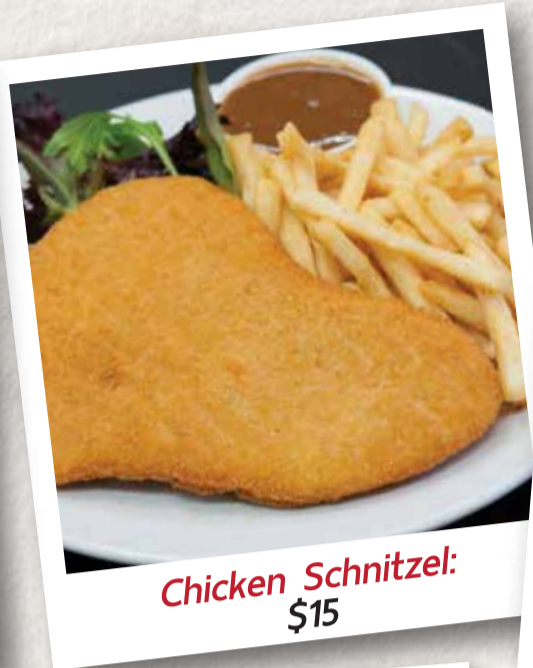
Chicken Schnitzel: $15