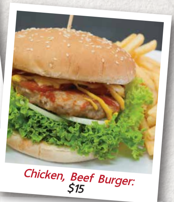
Chicken, Beef Burger: $15